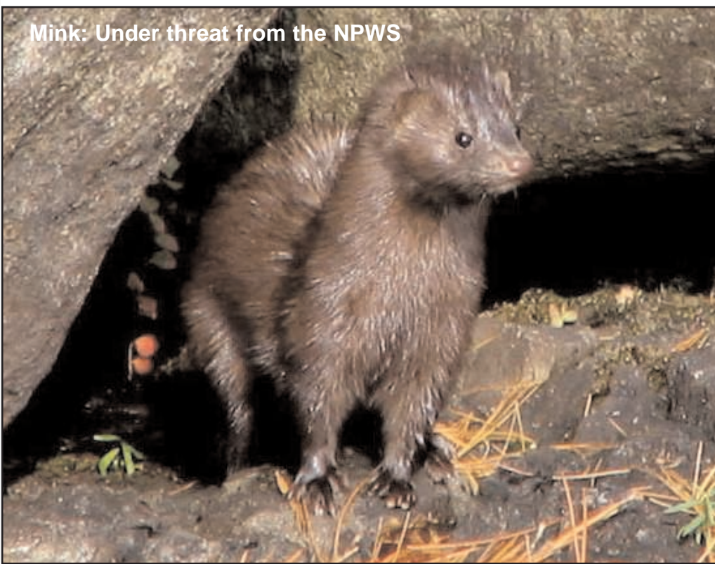
Mink: Under threat from the NPWS

ICABS is horrified that a Department of the Environment publication would present for consideration such shameful cruelty as digging out and terrierwork. We are currently awaiting a reply to our correspondence to Minister Gormley.