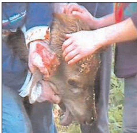
A bleeding and exhausted Ward Union deer at the end of a hunt. This activity is "no longer acceptable", Minister Gormley noted.

Responding to a defence of the hunt by Deputy McEntee, the Minister emphasised his determination to end the hunt "for animal welfare and public safety reasons"