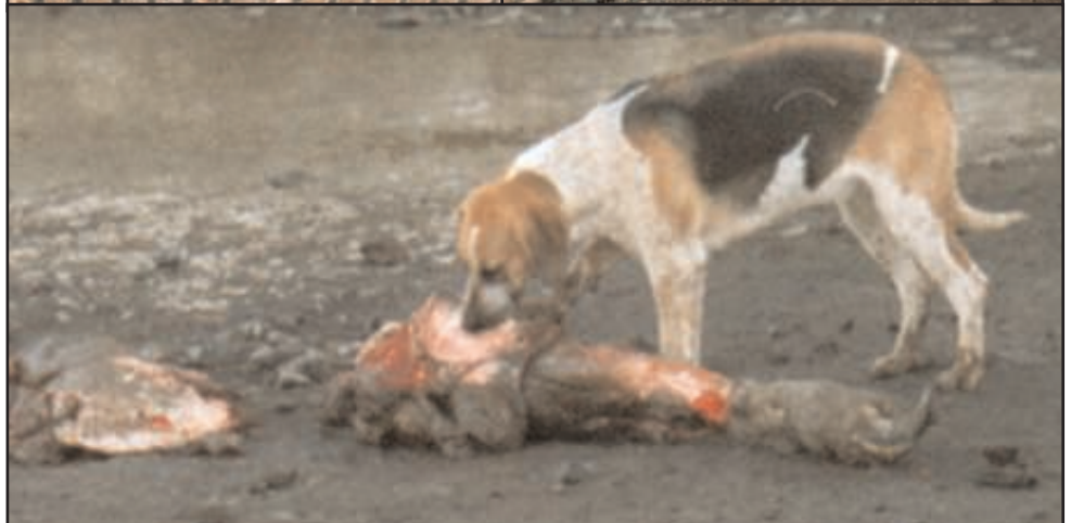
A miserable foxhound tries to squeeze beneath the gate of a hunt kennel, dogs jump against a kennel gate close to a green pool and a foxhound in filthy conditions gnaws at the leg of a cow.