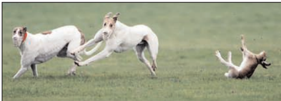
The NPWS recommended that a licence for the continuation of this disgusting cruelty be issued. Please respond to our action alert.