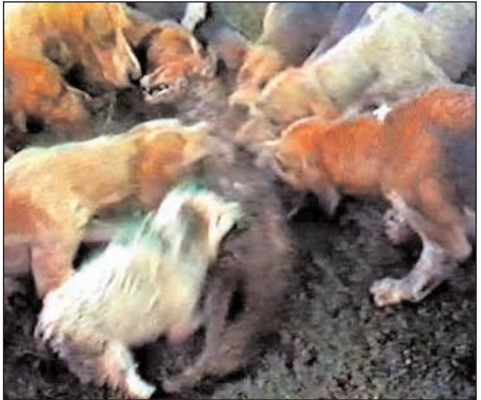
A pack of hounds attack and kill a fox at the end of a hunt. Please urge Minister Gormley not to exempt hunt groups.

In its pre-election manifesto, the Green Party pledged to end