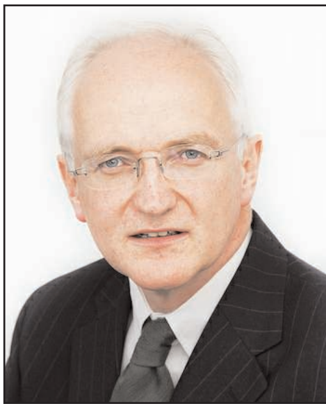
Minister John Gormley: His anti-hunt legislation imminent

"I believe a large proportion of the public consider such activity is no longer acceptable," he stated. "The Deputy may recall an incident a few years ago when a deer pursued by a pack of hounds entered a school yard during the school day. I find an incident like this totally intolerable."