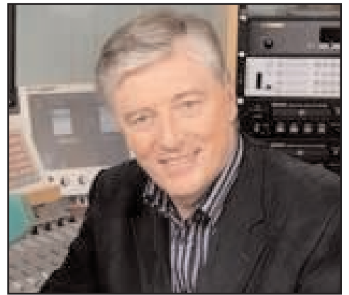
RTE presenter, Pat Kenny

ICABS welcomes this comment from the popular presenter.